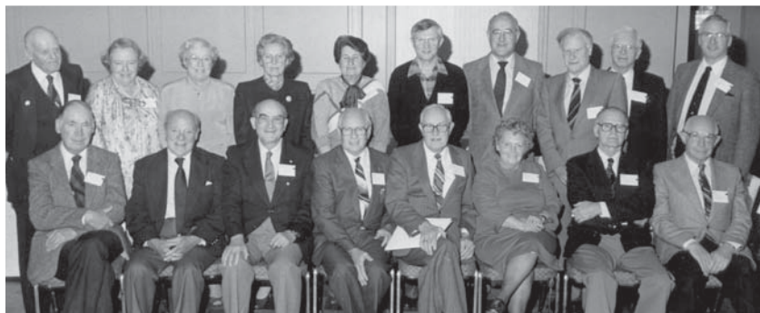
District newsletter editors gather for the first time at the 31 st Senate on November 12, 1986. Out of 36 Districts at the time, 22 publish newsletters.